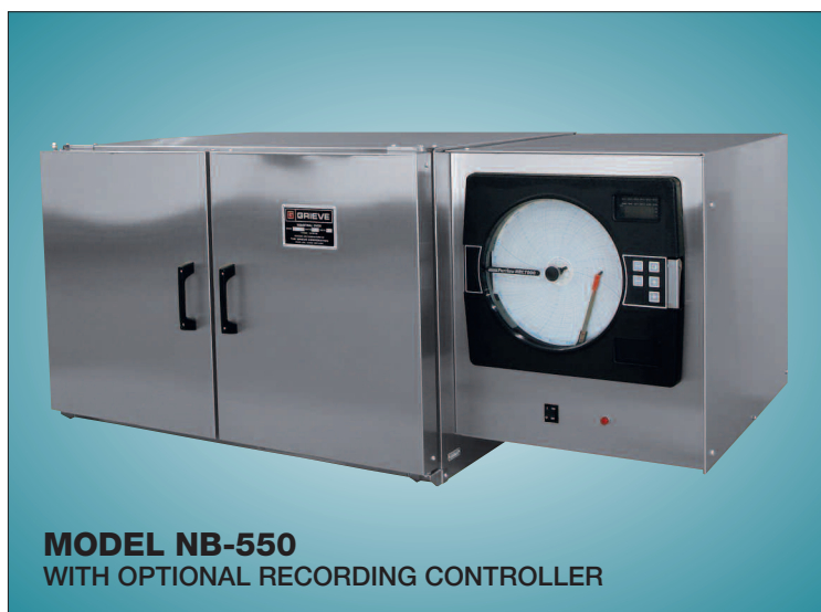
MODEL NB-550 WITH OPTIONAL RECORDING CONTROLLER