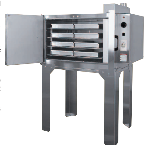
Model NB-350, including optional: — roof mounted, exhaust chamber adapter — drying pans and two (2) additional shelves — shut down timer — oven stand