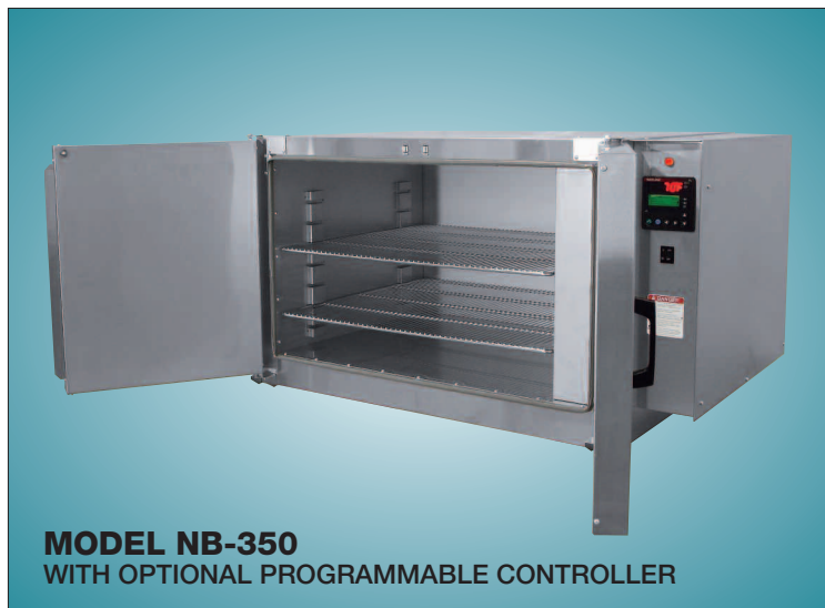
MODEL NB-350 WITH OPTIONAL PROGRAMMABLE CONTROLLER