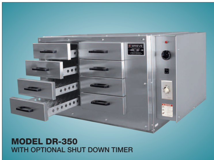
MODEL DR-350 WITH OPTIONAL SHUT DOWN TIMER