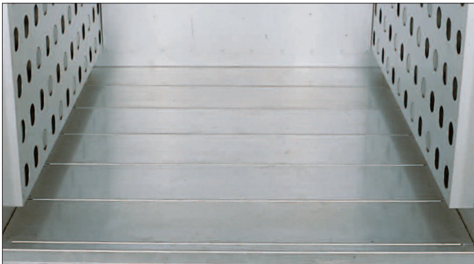
● Insulated Floor with steel plate cover , 2" for 500°F and 650°F, 3" at 800°F, minimizes heat loss and improves temperature uniformity near floor level, rated at 100 lbs per square foot distributed loading . . . . .IF