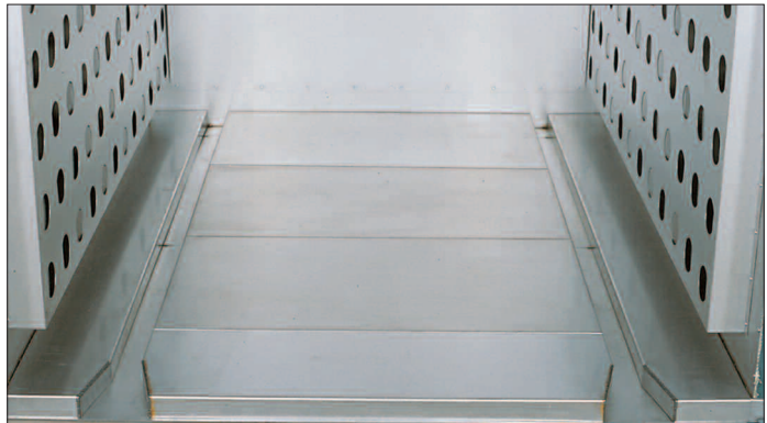
● Insulated Floor with Recessed Truck Tracks provides the reduced heat loss and improved temperature uniformity of insulated floor plus allows loading at factory floor level . . . .IFRTT