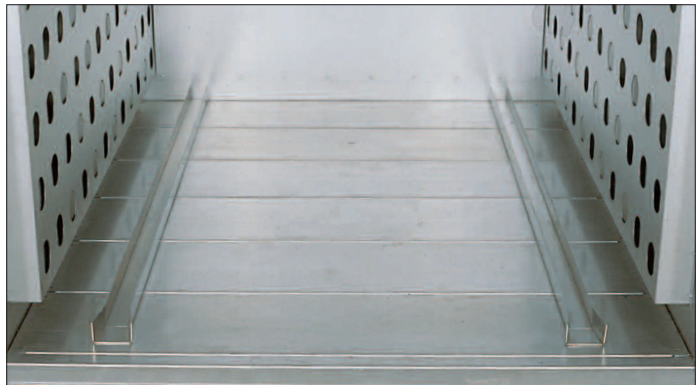
● Insulated Floor with Surface Truck Tracks used where oven will be recessed into the factory floor or loaded with an external ramp, includes drag seals on the oven doors. Total track loading limited to distributed floor loading of 100 lbs per square foot . . . . .IFSTT