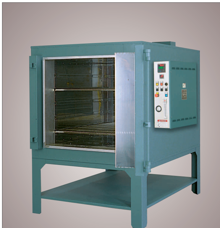
MODEL ID-750 WITH OPTIONAL 24" INTEGRAL OVEN LEGS

Specifications Subject to Change Without Notice Copyright The Grieve Corporation All Rights Reserved Printed in U.S.A. 3/09